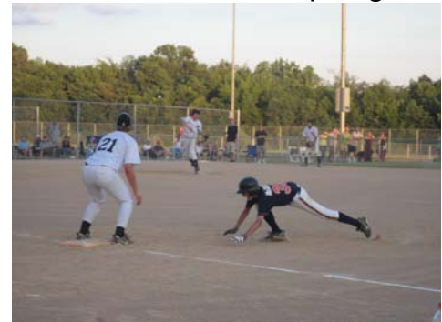
White Hawks made Blue work for runs